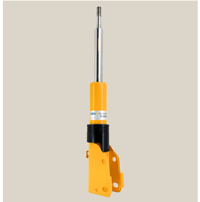
2. Install the supplied lower strut collar.