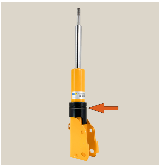
3. Install the supplied wire ring on the lowest strut collar groove.