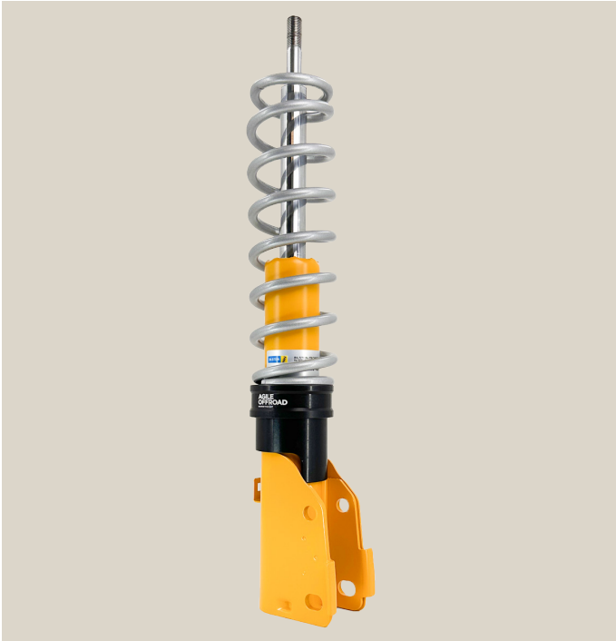
5. Install the supplied coil spring.