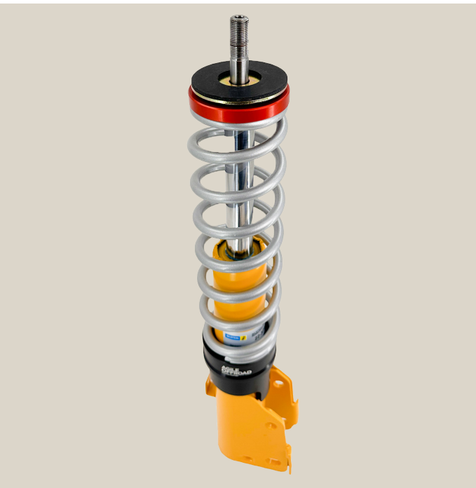
7. Install the supplied upper strut washer. Adhere the strut washer isolator to the upper strut washer.