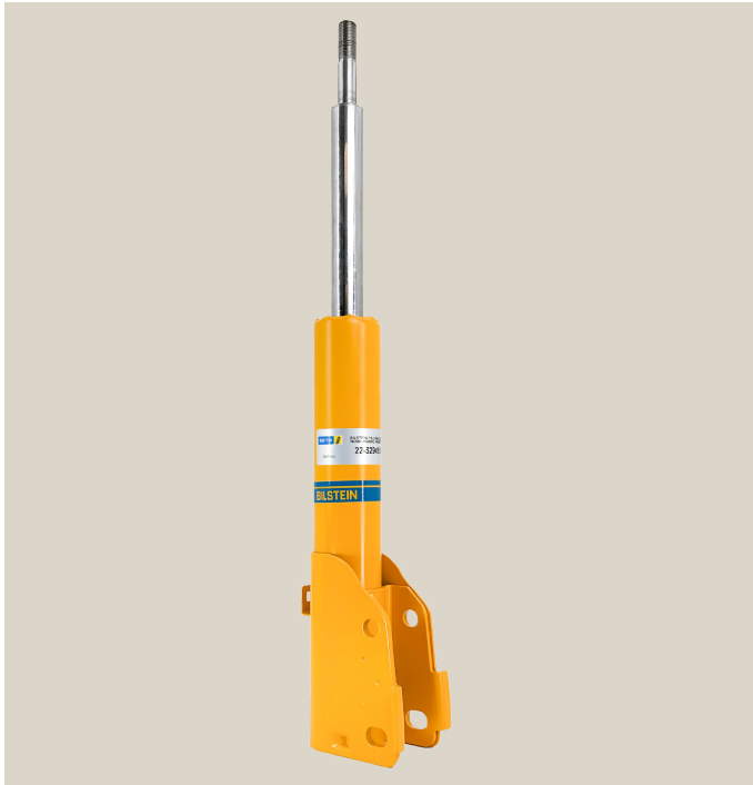
1. Start with a clean factory Mercedes or Bilstein strut.