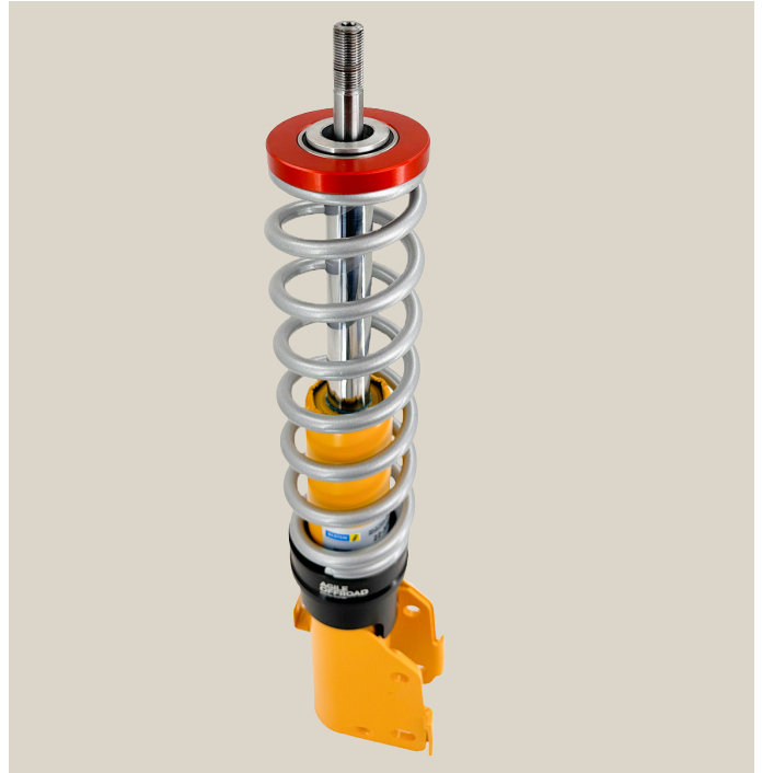
6. Install the supplied upper coil hat assembly.