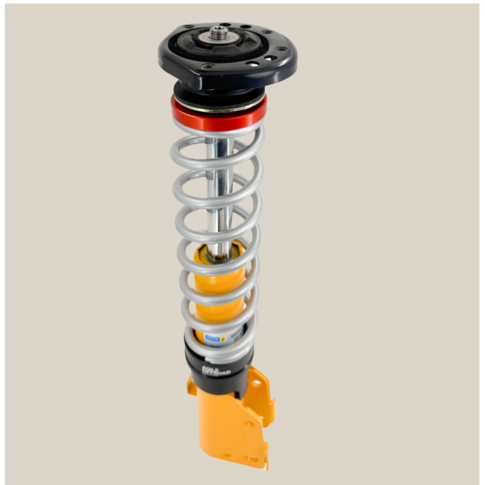
8. Install the upper strut mount. (sold separately) Inspect the upper strut mount if re-using the old unit.