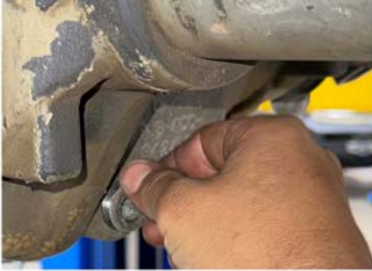
Re-install factory drain plug.