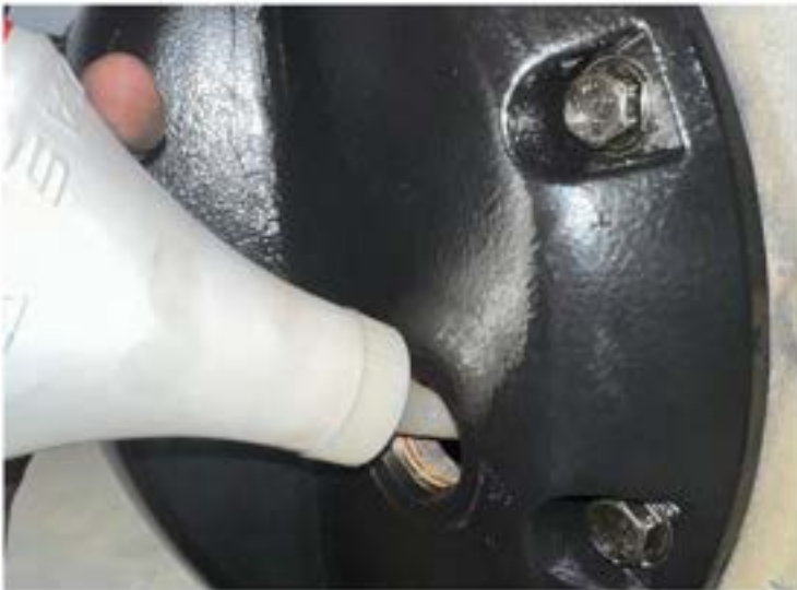
Fill differential with gear oil. Refer to your manual for specific year/model recommendation.