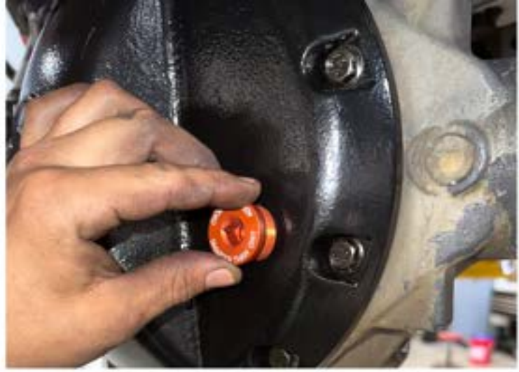
Use a 3/8" drive ratchet to remove the fill plug.