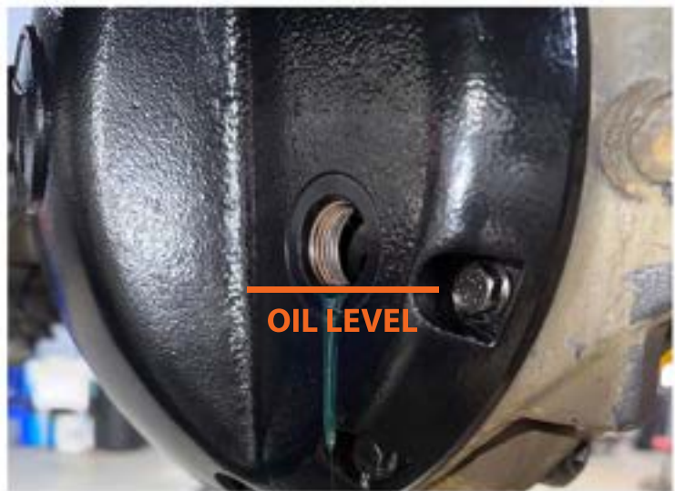
The oil level should be at the bottom of the fill hole.