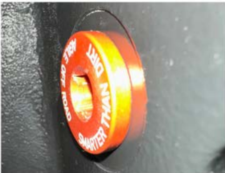
Use a 3/8" drive ratchet to install fill plug. Tighten until fill plug makes contact with AO Diff Cover.