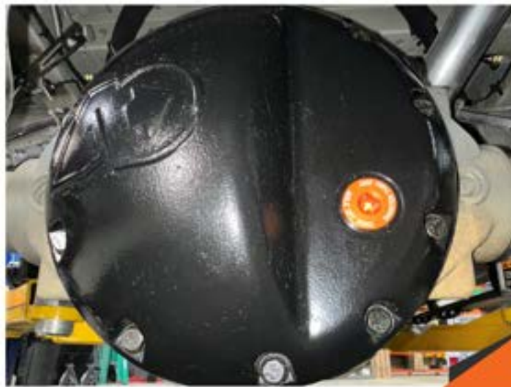
Congrats! Your installation is complete.