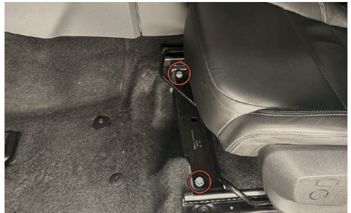
2. Use a 13mm wrench/socket to remove the two upper seat support bracket bolts.