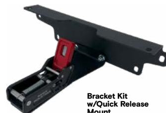
Bracket Kit w/Quick Release Mount