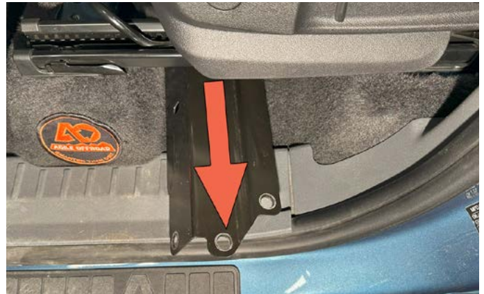
4. Remove bracket.