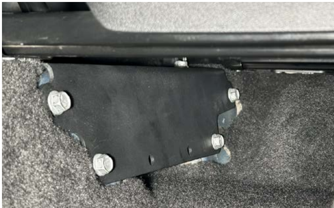
5. Install the AO lower seat support bracket using the factory bolts. Do not fully tighten.