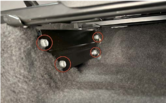
3. Use a 13mm wrench/socket to remove the four rear seat support bracket bolts.