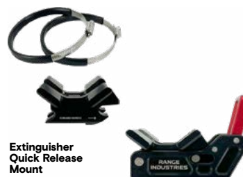
Extinguisher Quick Release Mount