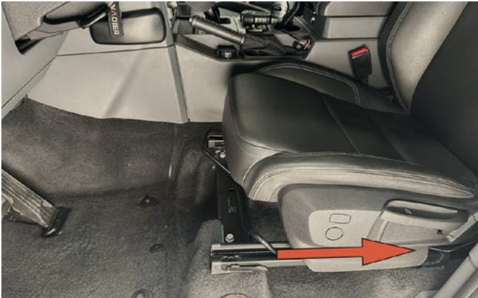
1. Unjack the driver side seat back.