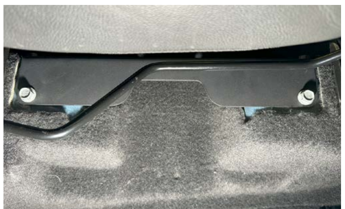
6. Install the factory bolts to the upper support bracket holes. Starting from the rear bolts, fully tighten all six bolts. Torque to 18 ft lbs.