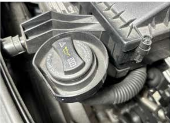
3. Remove the oil filler extension by pushing on the lower locking tab and sliding the assembly off air cleaner box.