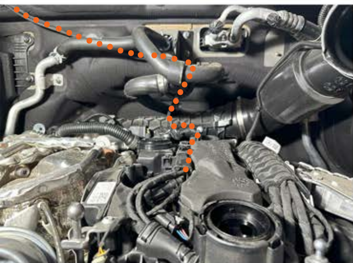
11. Route the supplied harness as shown from the cam sensor to the passenger side firewall pass-through boot. Use zip ties to attach harness.