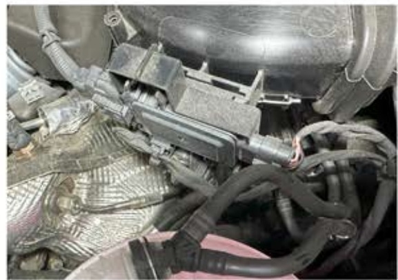
4. Remove the O2 sensor module by pushing on the lower locking tab and sliding the assembly off air cleaner box.

**It is not necessary to unplug any of the connectors**