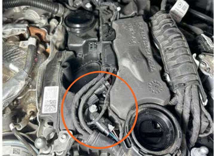
10. Install the male end of the supplied connector harness to the cam sensor. Connect the female end of the supplied connector to the OEM male cam connector. Tuck connectors as shown.