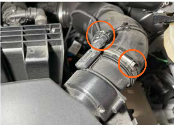
5. Remove the air flow sensor connector and loosen the air clean tube clamp.

**It is not necessary to unplug any of the connectors**