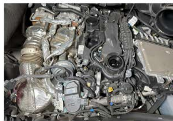
8. Remove filler tube and then remove foam isolation pad.