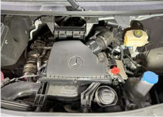
1. The cam sensor is located under the air box. The complete air box will need to be removed.