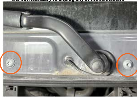
6. Use a T45 torx bit to remove the two air cleaner mounting bracket bolts located in the windshield cowl.