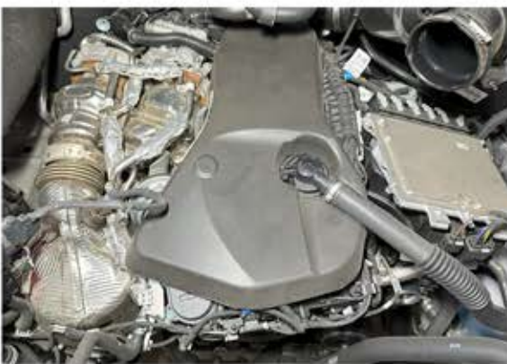
7. Slide air cleaner assembly back off of front mounts and completely remove.