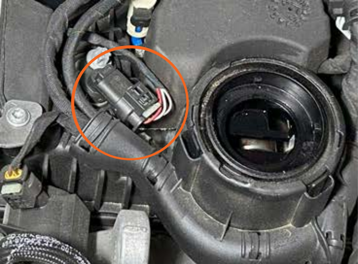
9. Locate the cam sensor as shown and disconnect cam sensor connector.