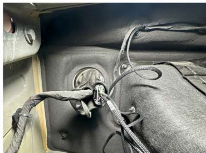
12. Cut the zip tie off of the passenger side pass through boot, remove the inner foam seal, and run the supplied harness through boot. Route the remainder of harness to the IOPedal module.

**Follow the IOPedal Instructions for Module Installation**