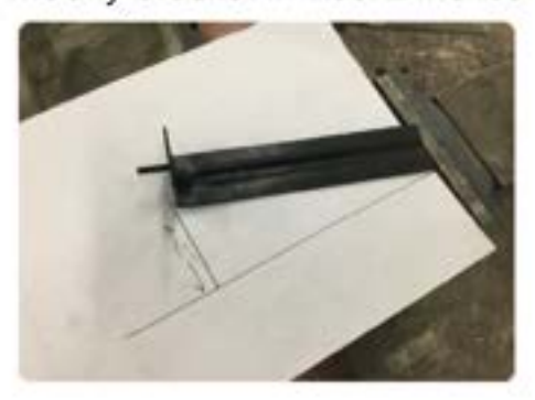
modify bracket in vise. 2 inches* trim bottom 2 clips with file **