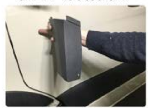
Re-install liner bracket using factory nut. Attach liner to lower bracket stud.