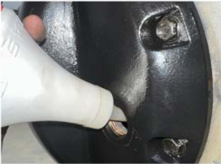
Fill differential with gear oil. Refer to your manual for specific year/model recommendation.