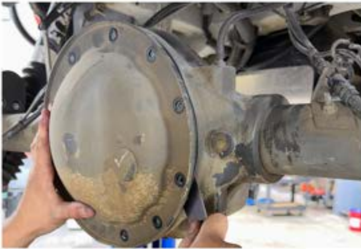
Use the gasket scraper to pry the cover off of the differential housing.