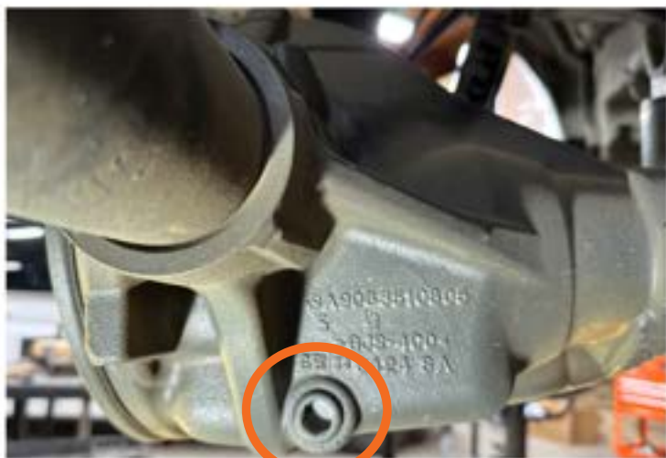
Locate the factory drain plug found on the passenger side of the differential.