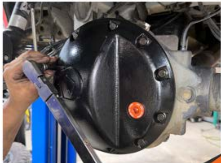
Tighten bolts using a criss-cross sequence. Torque to 22ft lbs.