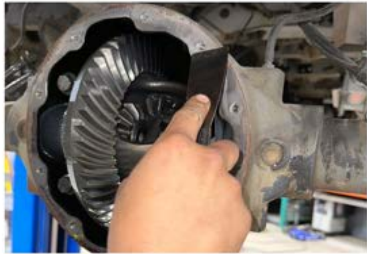
Use the gasket scraper to clean off any remaining gasket residue. Wipe clean.