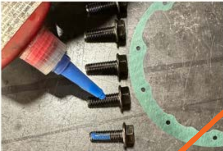
Prep supplied bolts by adding blue loctite. Orient gasket to AO Diff Cover mounting bolt holes.