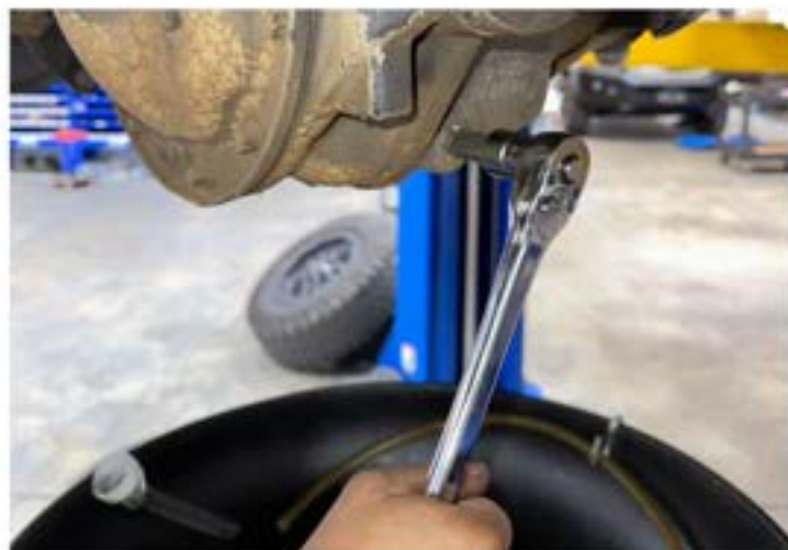
Use a 14mm allen/hex socket to remove the drain plug. Have drain pan ready to catch oil.