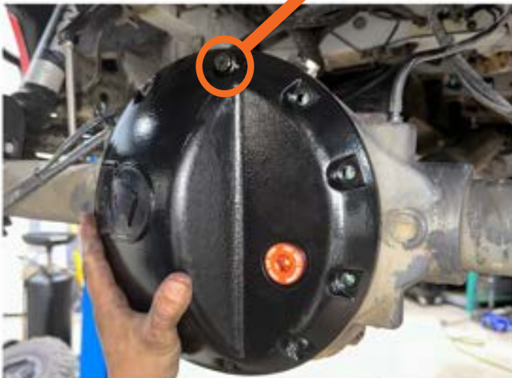
Place AO Diff Cover w/gasket on housing and hand tighten top bolt. Install remaining 9 bolts.