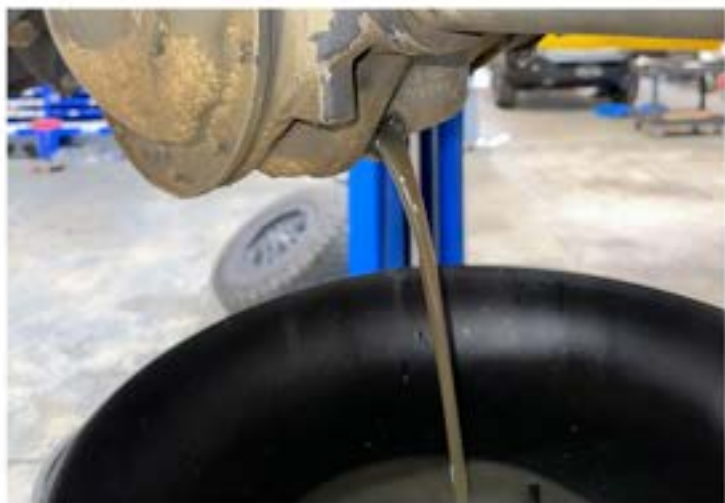
Allow differential to drain for several minutes before removing cover. **The oil will drain out quicker when warm**