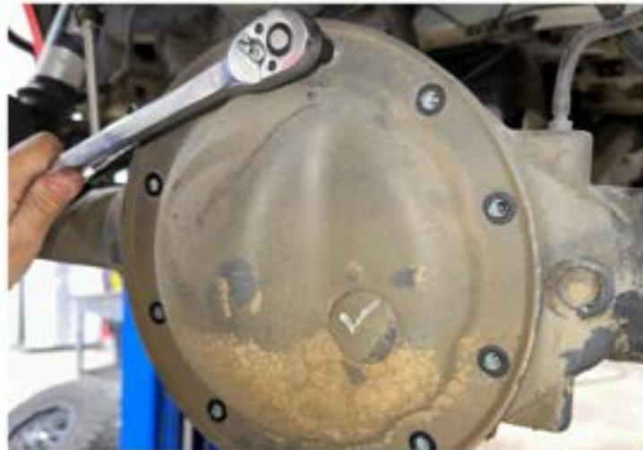
Use an E12 torx socket to remove the 10 differential cover bolts.