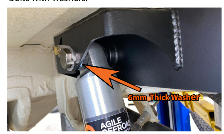
Install rear shocks using the supplied 14mm x 100mm upper bolts . Factory and Fox 2.0 shocks will require the use of the supplied 6mm thick washer. No spacer is required when using Fox 2.5 shocks. Re-use factory lower mounting hardware. **Use red Loctite on bolts**