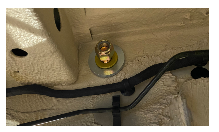
Install the supplied 1/2" large diameter washers, 1/2" small diameter washers, and 1/2" nyloc nuts to the inside of frame. At this time do not fully tighten.