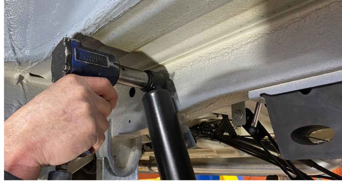
Use a 21mm socket to remove the upper shock bolt. Then use a 18mm socket and wrench to remove the lower shock bolt. Completely remove shock and set aside.