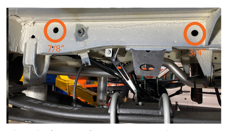
Clean the frame surface as necessary. The 2019+ Sprinter frame comes with two existing holes. The front hole is 7/8" and the rear hole is 3/4".