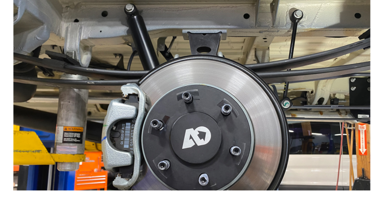
Lift and support vehicle as recommended by Mercedes and remove rear wheels.