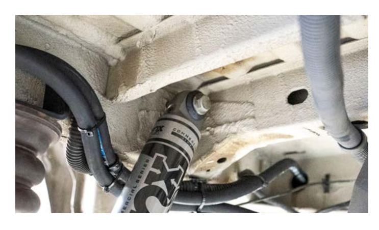
Install new shocks (boot-side down) and shock bolts on the inside of the frame rail.