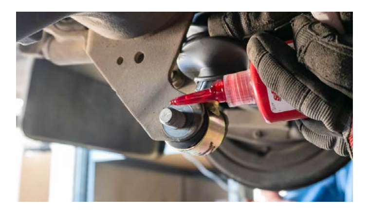
Apply thread-locker and install the lower shock hardware.