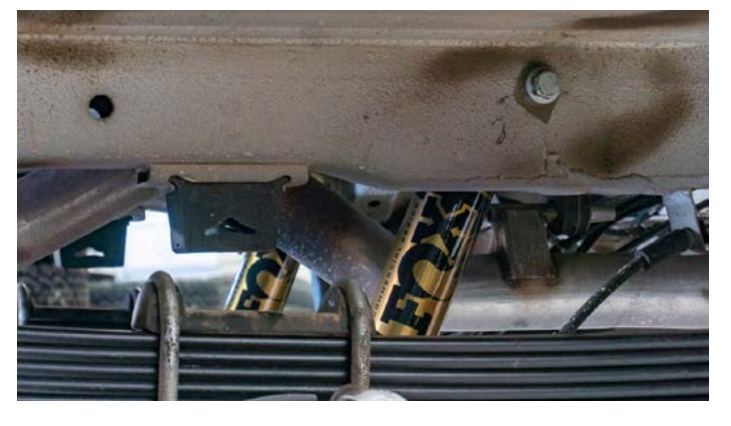
Torque upper shock bolt to 110 ft-Lbs. Torque lower shock bolt to 110 ft-Lbs.

Reinstall wheels & torque lugs. Steel wheels 140 ft-Lbs. Alloy wheels 125 ft-Lbs.