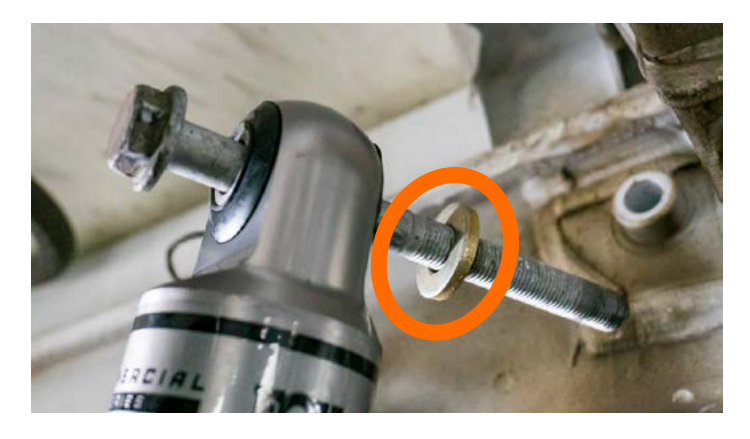
Clean the factory hardware. The included washers are to be installed between the shock body & the frame rail.