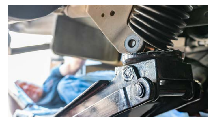
Use a jack to compress the shock. Line up the lower shock mount holes on the axle with the shock and install the shock bolt.