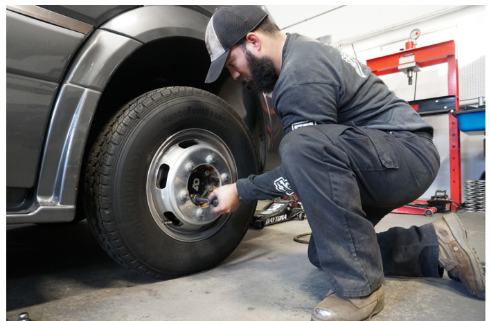
Re-install wheels. Lower vehicle on the ground. Torque hub spacer bolts 140 ft-lbs. Then torque lug nuts to 120 ft-lbs.