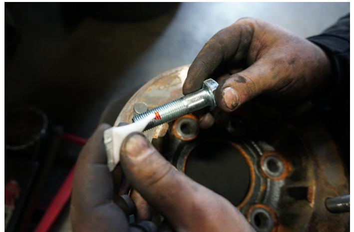
Apply a small amount of red loctite to supplied bolts.