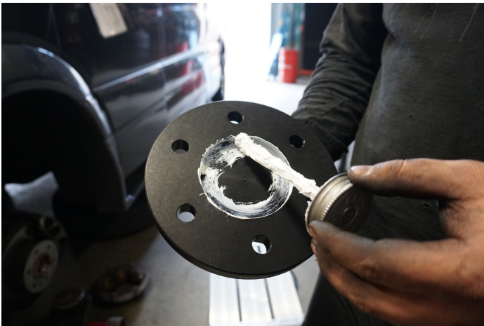
Apply a small amount of anti-seize to where the wheel spacer sits on the rotor flange. Install Agile Spacer.