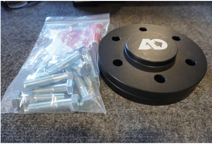
New hub spacer bolts are supplied with the kit.