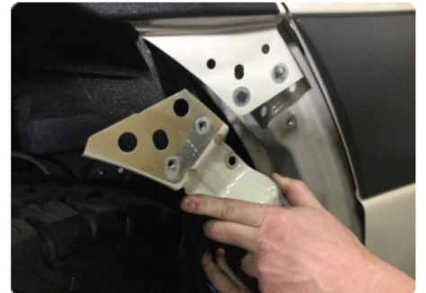
bend sill down and pull