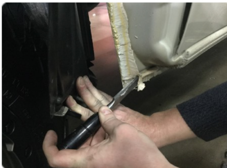
remove excess sealant