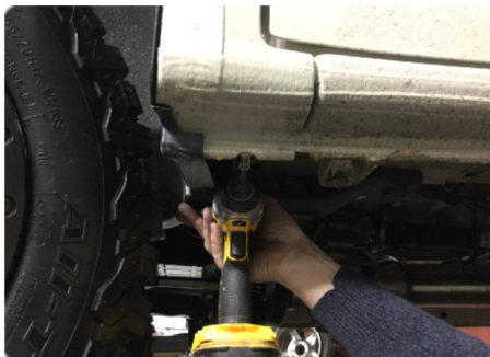
remove lower 10mm nut