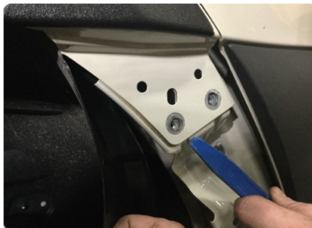
pry fender from sill