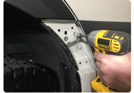
remove 3 10mm bolts