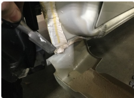
cut sealant and pry here